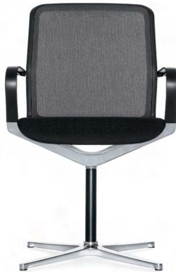
9421PA CONFERENCE CHAIR—MESH BACK, UPHOLSTERED SEAT, POLISHED ALUMINUM BASE 9461PA GUEST CHAIR—MESH BACK, UPHOLSTERED SEAT, POLISHED ALUMINUM BASE