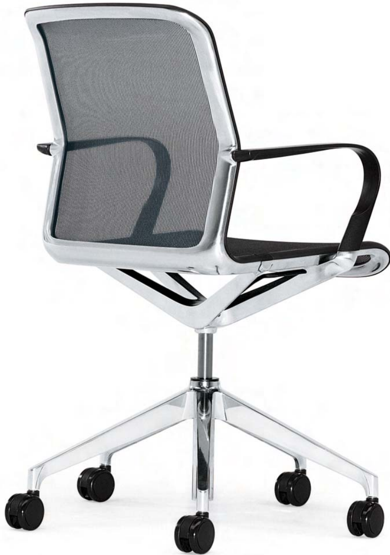
9411PA CONFERENCE CHAIR-POLISHED ALUMINUM BASE COVER IMAGE 9411PA CONFERENCE CHAIR-POLISHED ALUMINUM BASE