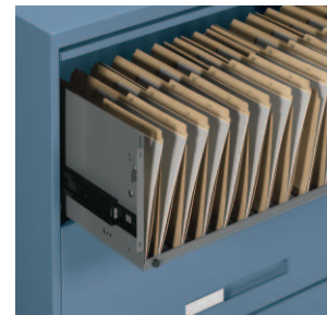
Full depth shelves for legal documents