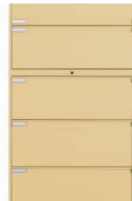
Available with ADA lock option (American Disability Act)