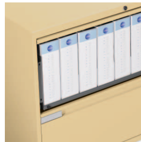
Receding door fully recedes. All doors feature an extra support channel