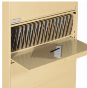
Optional posting shelf with spring loaded touch latch