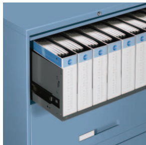
Ring binder storage in "B" type receding door openings