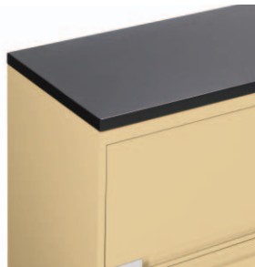
Optional laminate top