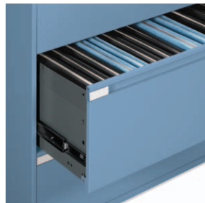
Side to side EDP hanging data binder storage using two point suspension