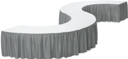
Buffet - Traditional Above uses 4 x FTSP3084 Serpentine Shape Tables 30"D x 84"W x 29"H