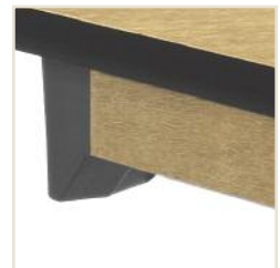
Wood Edge Band Apron