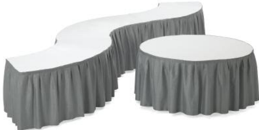
Head Table - Traditional Above uses 4 x FTSP3084 Serpentine Shape Tables 30"D x 84"W x 29"H and 1 x FTRP60D Round Shape Table 60" dia. x 29"H