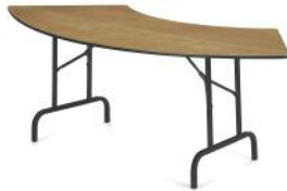
Banquet - Serpentine