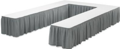
Teleconference Above uses 5 x FTP60 Rectangle Shape Tables 30"D x 72"W x 29"H

Global's banquet and commercial grade tables provide the flexibility to create various configurations to best suit your banquet hall needs.