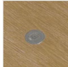
Bolt through fasteners