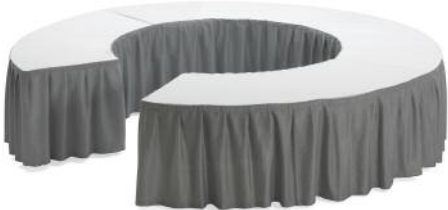
Buffet - Round Above uses 3 x FTSP3084 Serpentine Shape Tables 30"D x 84"W x 29"H