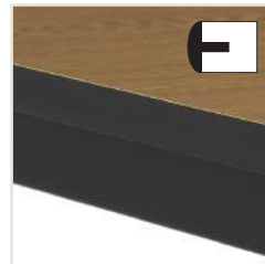
T - Mold

Above uses 2 x FTRP72D Round Tables 72" dia x 29"H and 3 x FTSP3084 Serpentine Shape Tables 30"D x 84"W x 29"H