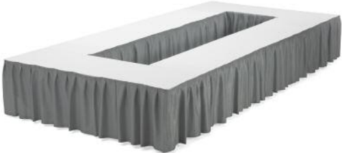
Conference Rectangular Above uses 6 x FTP60 Rectangle Shape Tables 30"D x 72"W x 29"H