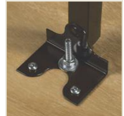
Bolt through fastener