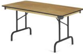
Banquet - Rectangular