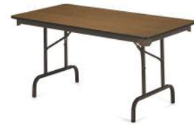
Commercial - Rectangular: Commercial grade tables have laminate tops with either Black, Chrome or Brown legs.