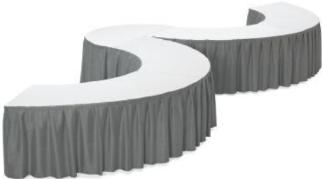
Dessert Table Above uses 1 x FT12RP60D Half Round Shape Table 60" dia. x 29"H and 4 x FTSP3084 Serpentine Shape Tables 30"D x 84"W x 29"H