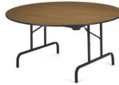
Banquet - Round