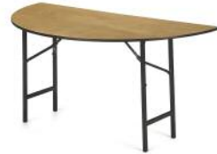
Banquet - Half Round