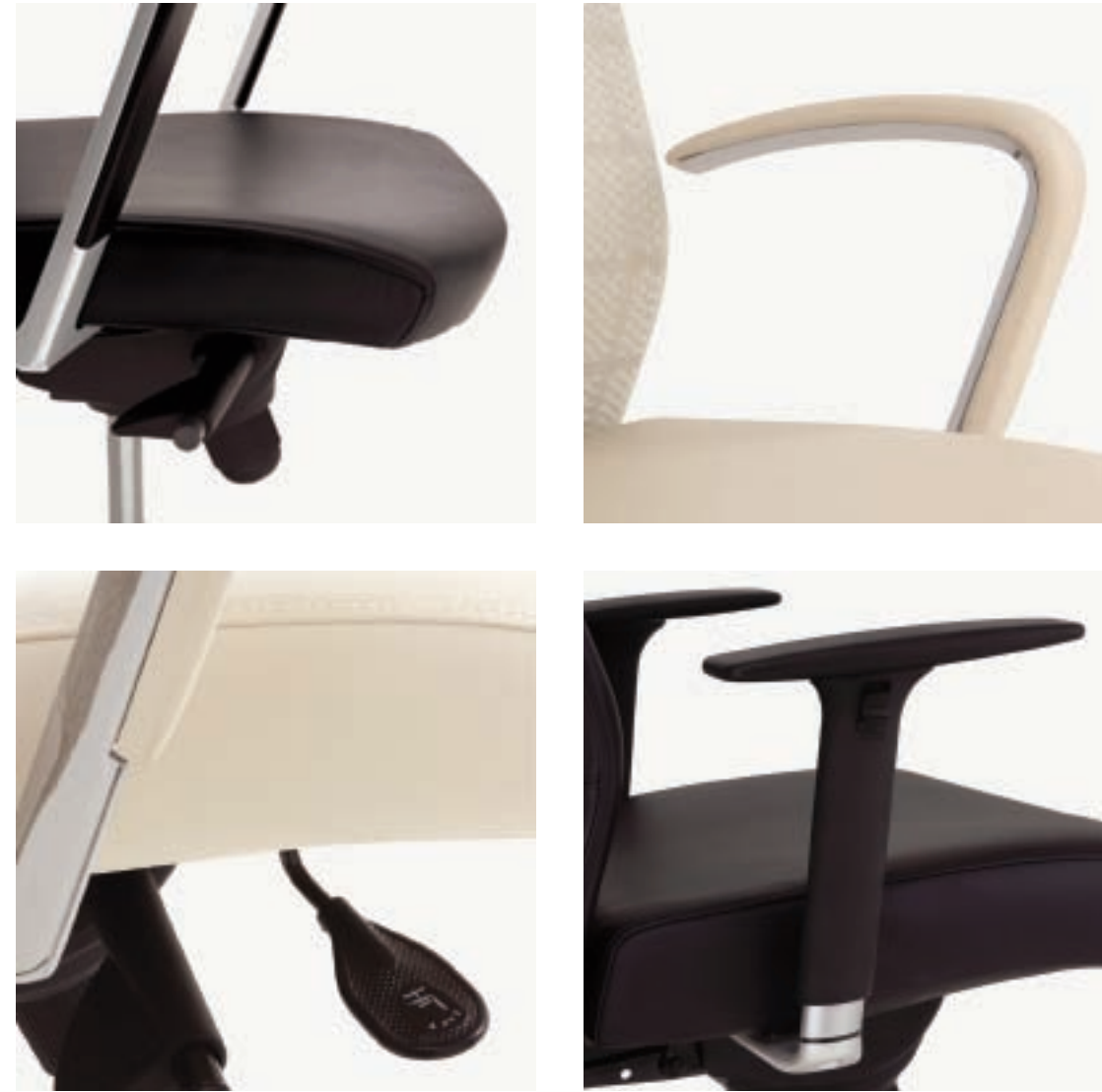
TOP LEFT: The Synchro Tilt mechanism, which provides a single lever controlling a range of tilt lock locations, an anti-kickback release, and gas lift height adjustment; TOP RIGHT: Leather wrapped fixed arm available with Silver Metallic finish. (Available in S Line only); BOTTOM LEFT: Seat slider mechanism; BOTTOM RIGHT: Optional textured plastic adjustable arm.